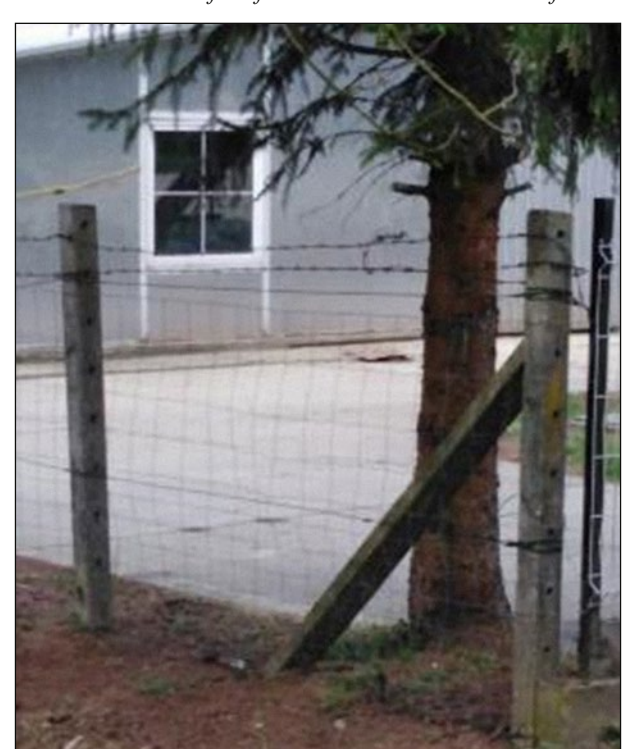
Picture 9: One element of the fence on the northern section of the WWTP