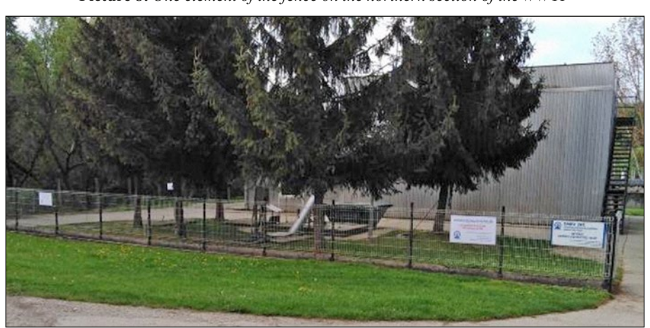
Picture 8: One element of the fence on the northern section of the WWTP

As it can be seen on the picture the size of the WWTP is not large, thus the length of the fence marking the boundary is not long either.